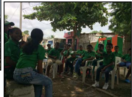
Community based organisations